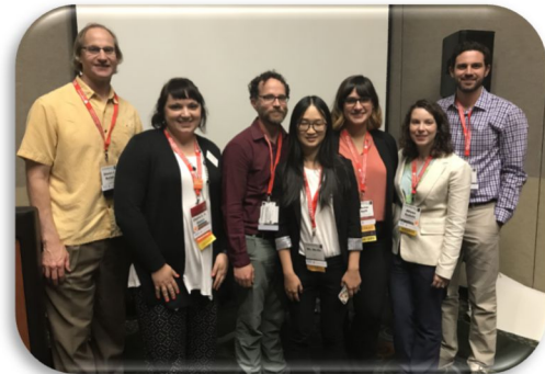
Above: Session M506 presenters.