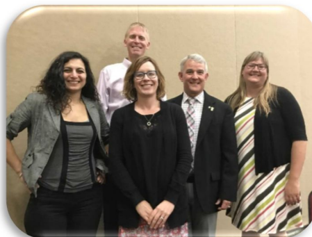
Above: Session M306 presenters.