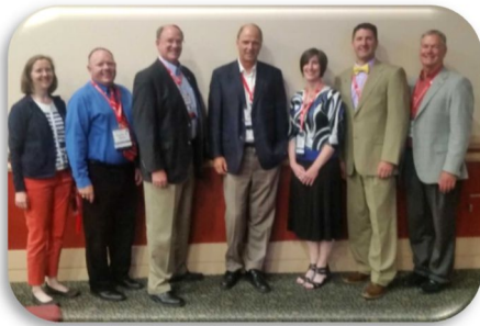
Above: Session T506 presenters.