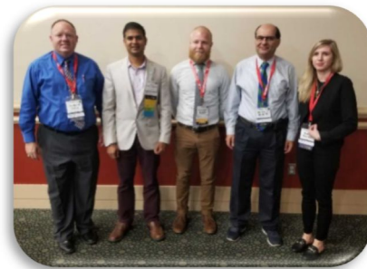
Above: Session W106 presenters.