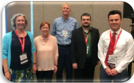
Above: Session W406 presenters.