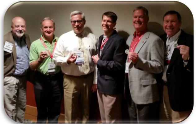
Above: Session T106B presenters.