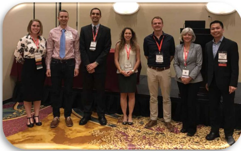
Above: Session M406 presenters.