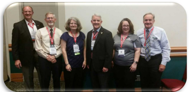
Above: Session W506 presenters.